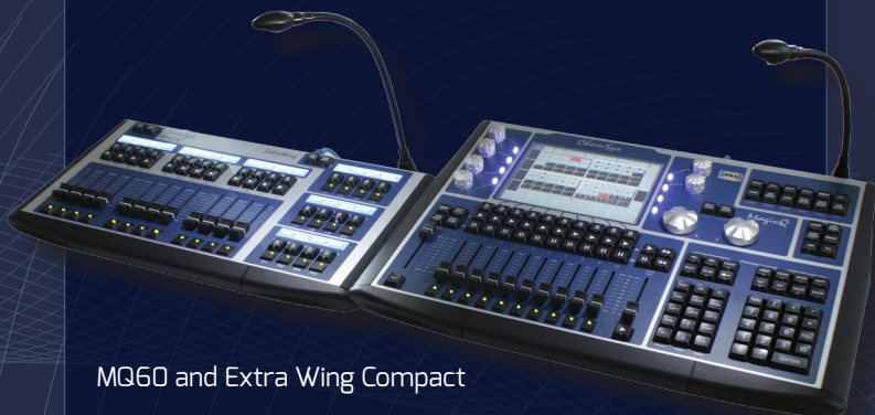
MQ60 and Extra Wing Compact

0300-0047 Padded Bag for MagicQ PC Wing Compact/Extra Wing Compact