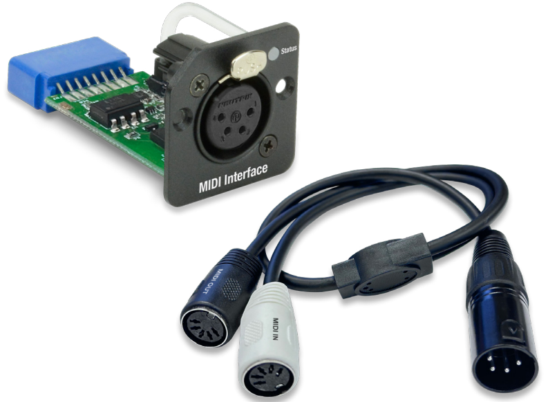
SM-MIDI MIDI Smart Module w/5-pin DIN Pigtail Cable

Additionally, an LED indicator on the module provides at-a-glance operational status.