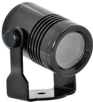
Gantom DMX Floodlight