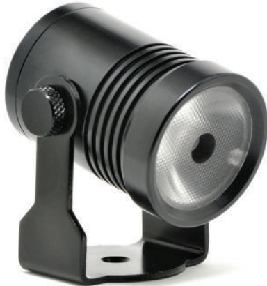
Gantom DMX Spotlight