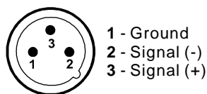
DMX-IN XLR Connector - Plug: