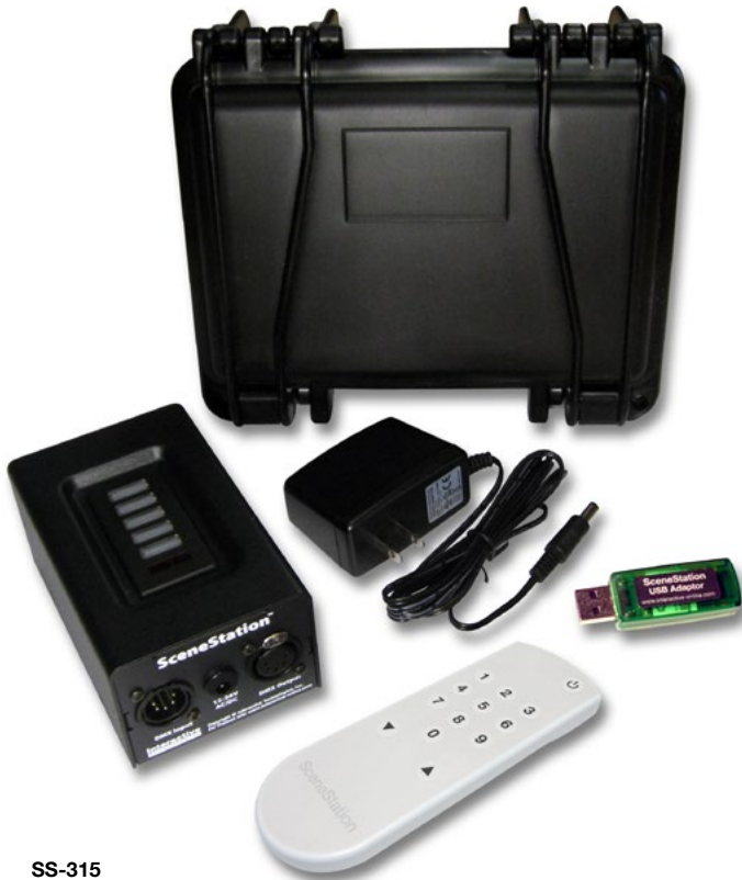
SS-315 Portable SceneStation Kit