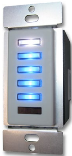
SS-305 SceneStation (white)