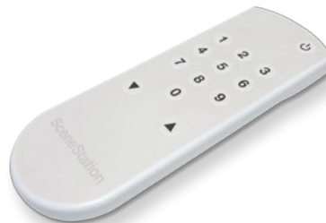
SS-UR1 User's IR Remote

SceneStation can control virtually any device that operates from a standard DMX signal. SceneStation’s DMX port is bi-directional, allowing SceneStation to control DMX fixtures, record DMX scenes or to automatically act as a console backup.