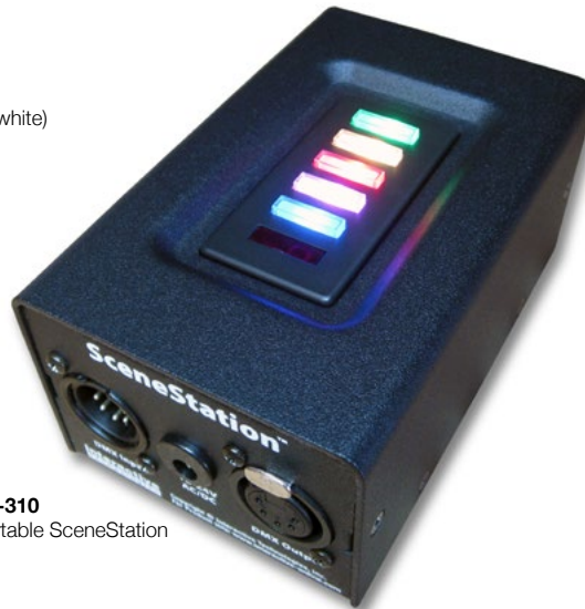
SS-310 Portable SceneStation

Another important feature of SceneStation is how easy it is to program. The powerful SceneStation Studio software (available for Mac or Windows) is a simple, but sophisticated graphical environment for setting up and building content for SceneStation.