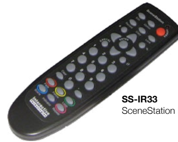
SS-IR33 SceneStation Programmer's Remote

Additionally, SceneStation can be programmed without a computer using either the Programmer's IR Remote, or by capturing DMX scenes from an external console using only the station's front-panel buttons.