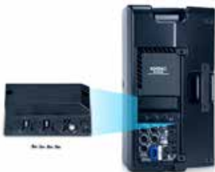
K.2 LOC (Lock-Out Cover)