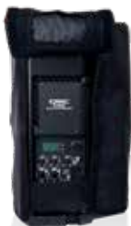
K.2 Series Outdoor Cover (rear flap opened)