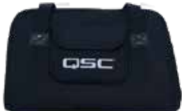
K.2 Series Totes